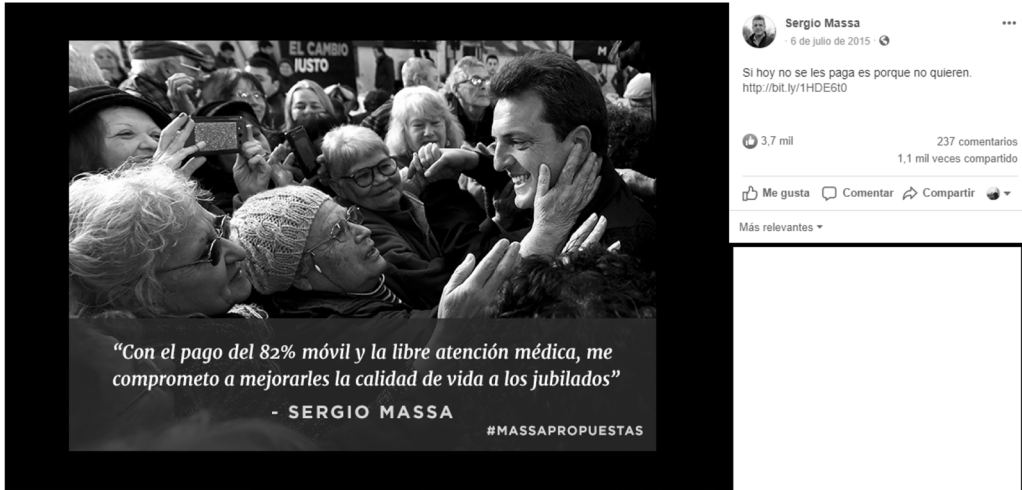
Image 6. Example of the indignation that Massa expressed on his Facebook messages during the studied period.