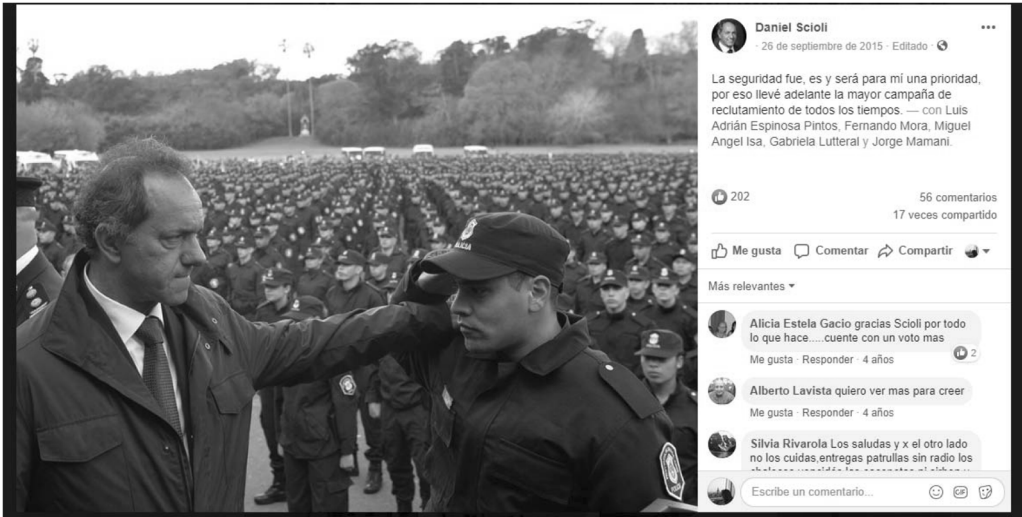
Image 4. “Security was, is and is going to be a priority for me. For this, I carried out the greatest recruitment of security agents ever”.