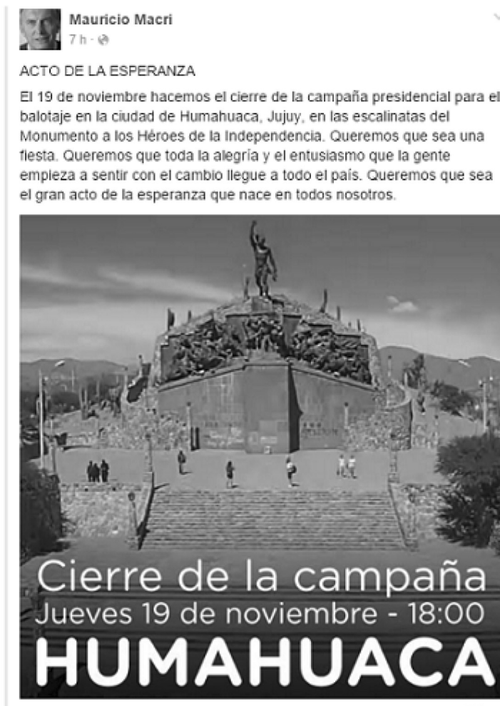
Image 5. Macri was the one who prioritized hope in his emotive content. In this post, he announced the closing event of his electoral campaign. The name of the event was: The celebration of hope (the title of the post).