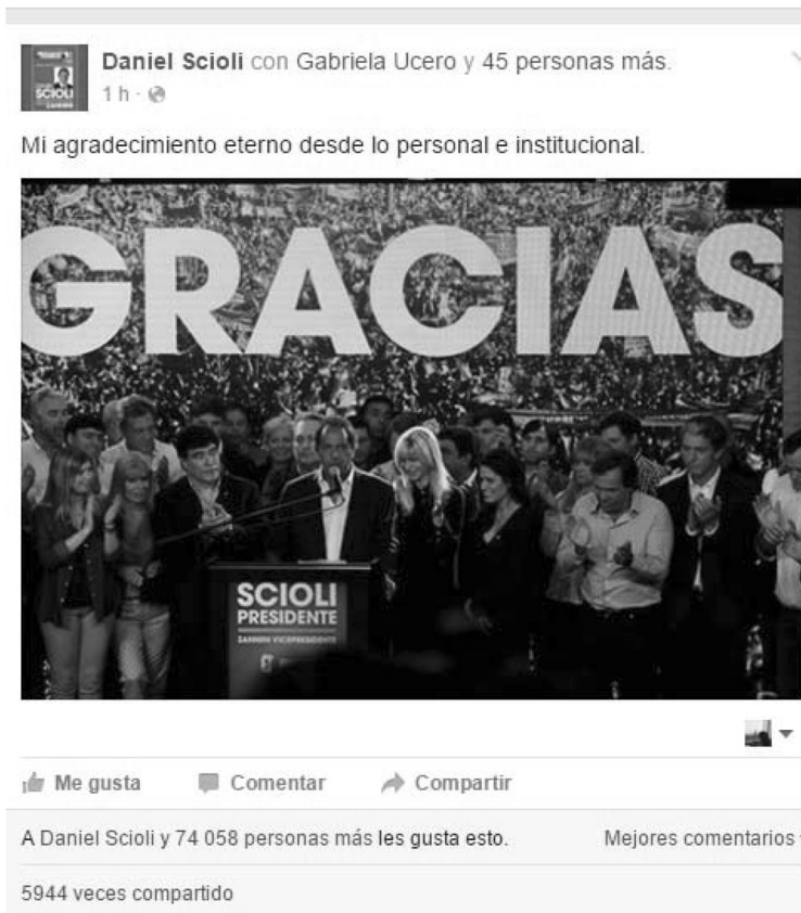
Image 2. Daniel Scioli, in a massive event, after knowing the general election's results.