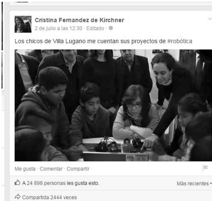
Image 1. Cristina Fernández during an informal visit to a school in the surroundings of Buenos Aires.